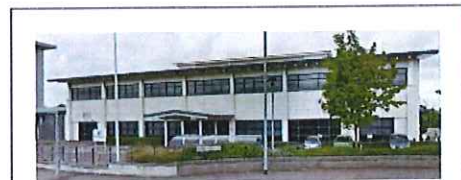
The Coroner's Service Beacon House, Whitehouse Road, Ipswich, Suffolk IP1 5PB